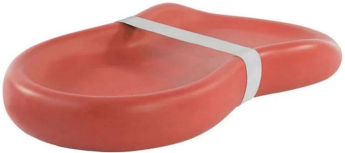
Hot sale high density customised changing mat for baby