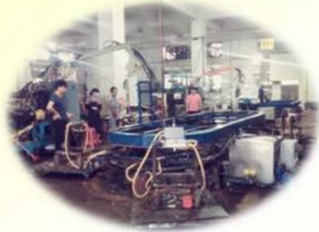
Lean Production Lines