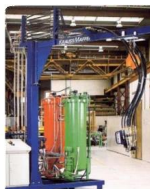
* PU Foaming Equipment PU(聚氨酯) 发泡设备