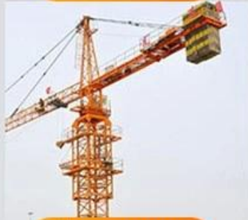
Tower crane construction equipment