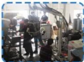
Lean production lines on 4th Floor