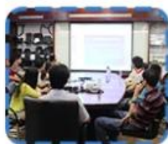
Xiamen University training course