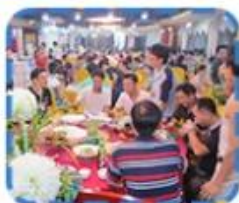
The Mid Autumn Festival