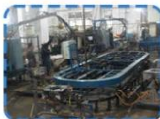
Cap & base sets production lines on the 1st Floor