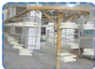
Cap & base products painting production lines on the 2nd floor