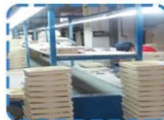
Polishing production lines on the 2nd Floor