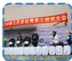
Excellent employee Award Presentation Ceremony