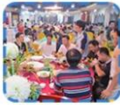
The Mid Autumn Festival