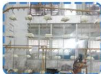
Painting production lines on the 1st Floor