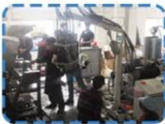
Lean production lines on 4th Floor