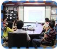
Xiamen University training course