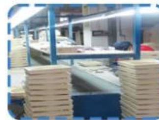
Polishing production lines on the 2nd Floor