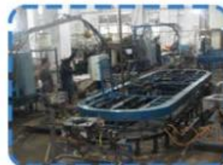
Cap & base sets production lines on the 1st Floor