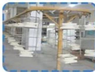
Cap & base products painting production lines on the 2nd floor