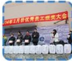
Excellent employee Award Presentation Ceremony