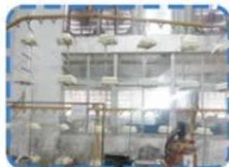
Painting production lines on the 1st Floor