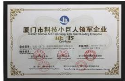
Xiamen Science and Technology Little Giant Leading Enterprise