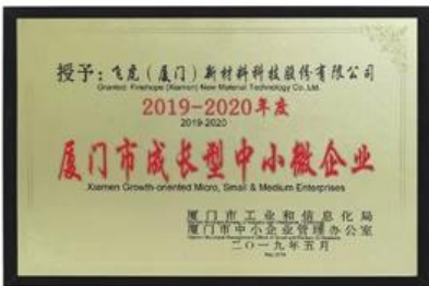
Xiamen Growth-oriented Micro, Small & Medium Enterprises