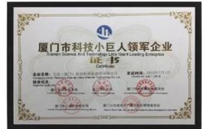
Xiamen Science and Technology Little Giant Leading Enterprise