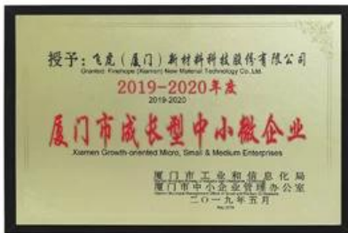
Xiamen Growth-oriented Micro, Small & Medium Enterprises