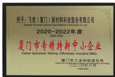
Xiamen Specialized, Refining, Differentiate, Innovative SMEs