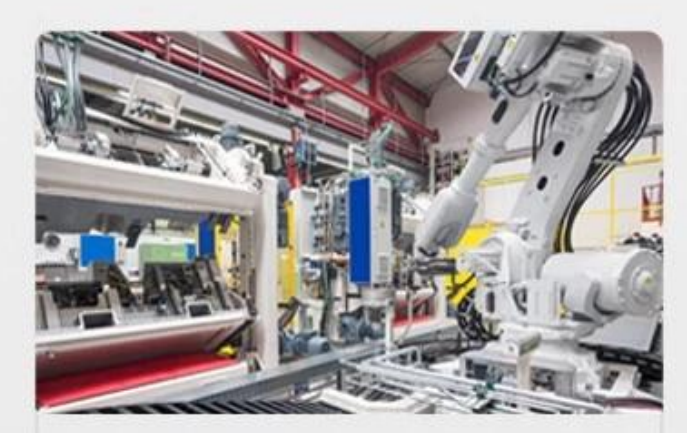
Robot spray mould release agent and injection PU raw material