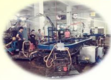
Lean Production Lines