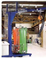
• PU Foaming Equipment PU(聚氨酯)发泡设备