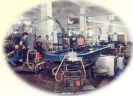
Lean Production Lines