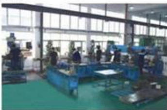
Moulds Workshop 模具车间