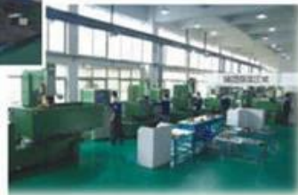
• PU Foaming Equipment

◆ Own the ability of independent improvement for the production equipments, and independent design and R & D ability of automatic moulds and jigs, lean automatic production lines.