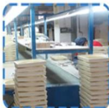
Polishing production lines on the 2nd Floor