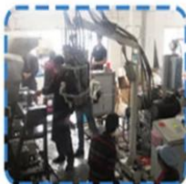
Lean production lines on 4th Floor