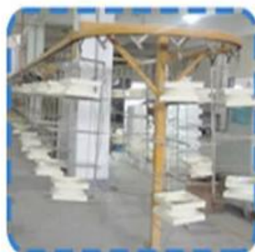
Cap & base products painting production lines on the 2nd floor