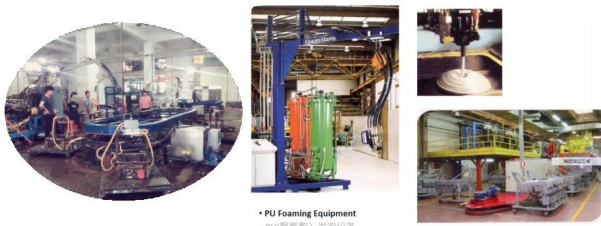
• PU Foaming Equipment PU(聚氨酯)发泡设备