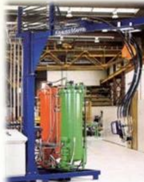
• PU Foaming Equipment