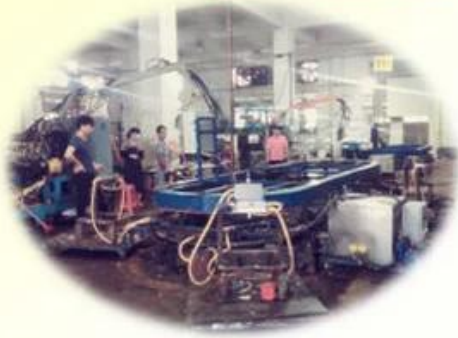
Lean Production Lines