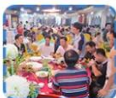
The Mid Autumn Festival