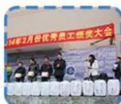
Excellent employee Award Presentation Ceremony