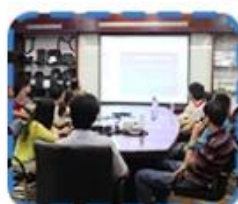
Xiamen University training course