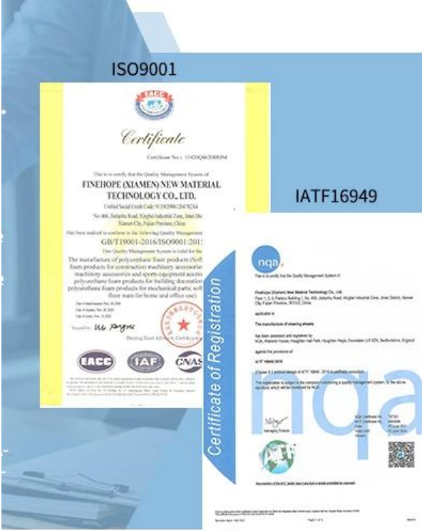
Finehope 2003 ISO 9001

1. PU 2. PU 3. 200-250kg/m 3 4. 5. 6. 7. 30% 8. 1,000 9. 10. RoSH REACH EN71-3 11. OEM 12. PU