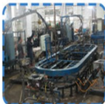
Cap & base sets production lines on the 1st Floor