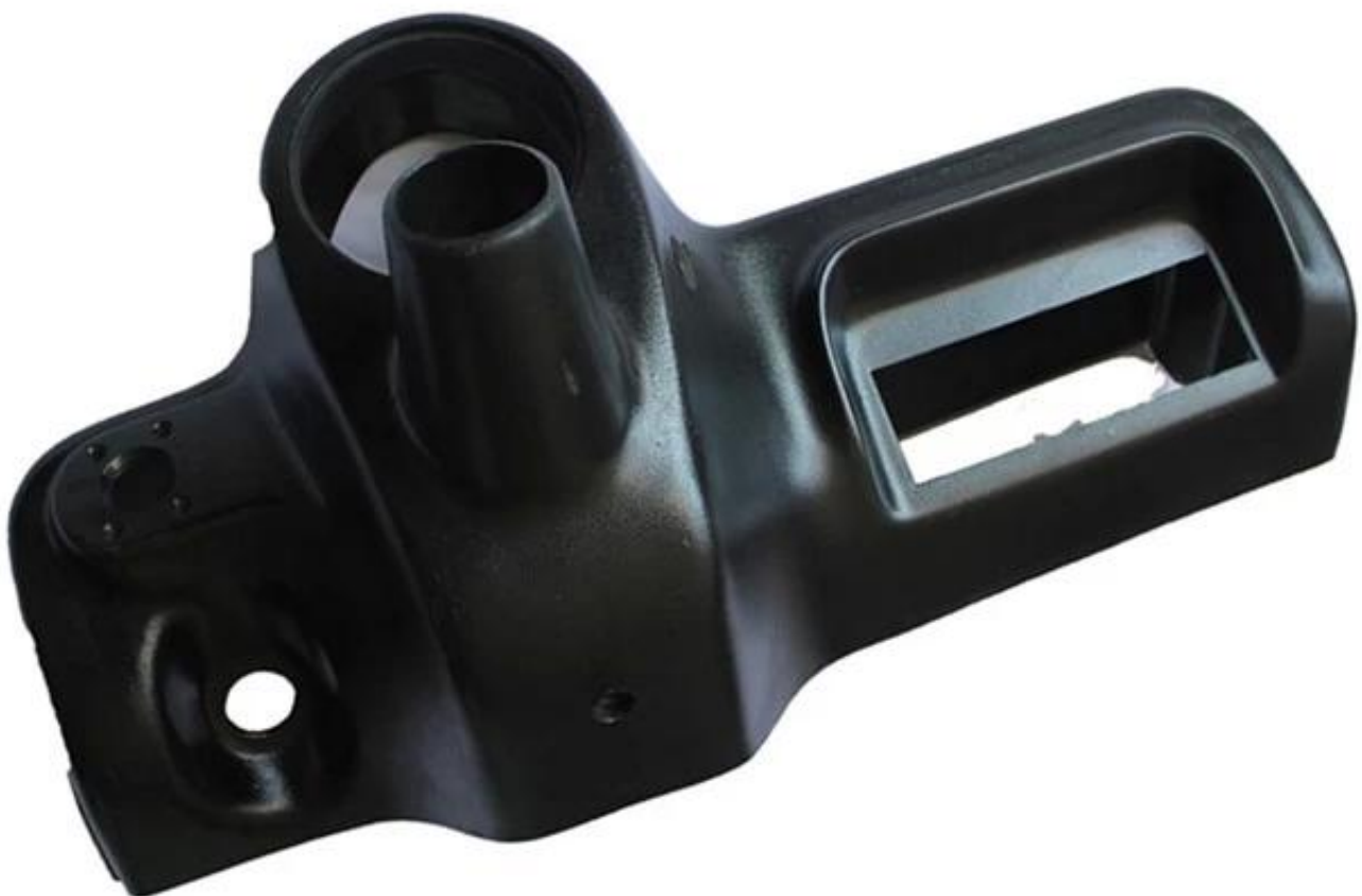
Werksseitige Anpassung des Armaturenbretts für Maschinengabelteile aus