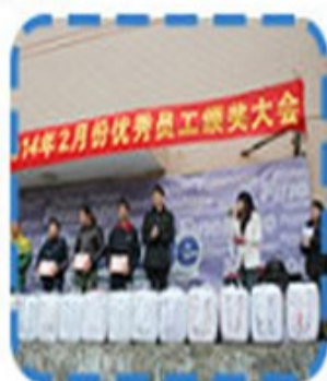
Excellent employee Award Presentation Ceremony