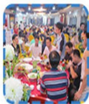
The Mid Autumn Festival