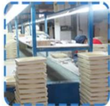
Polishing production lines on the 2nd Floor