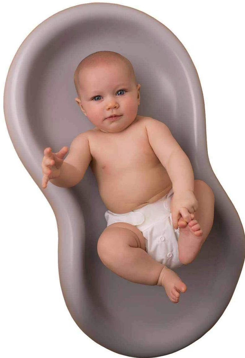
Cambiadores de pañales impermeables para bebés de alta densidad personalizados al por