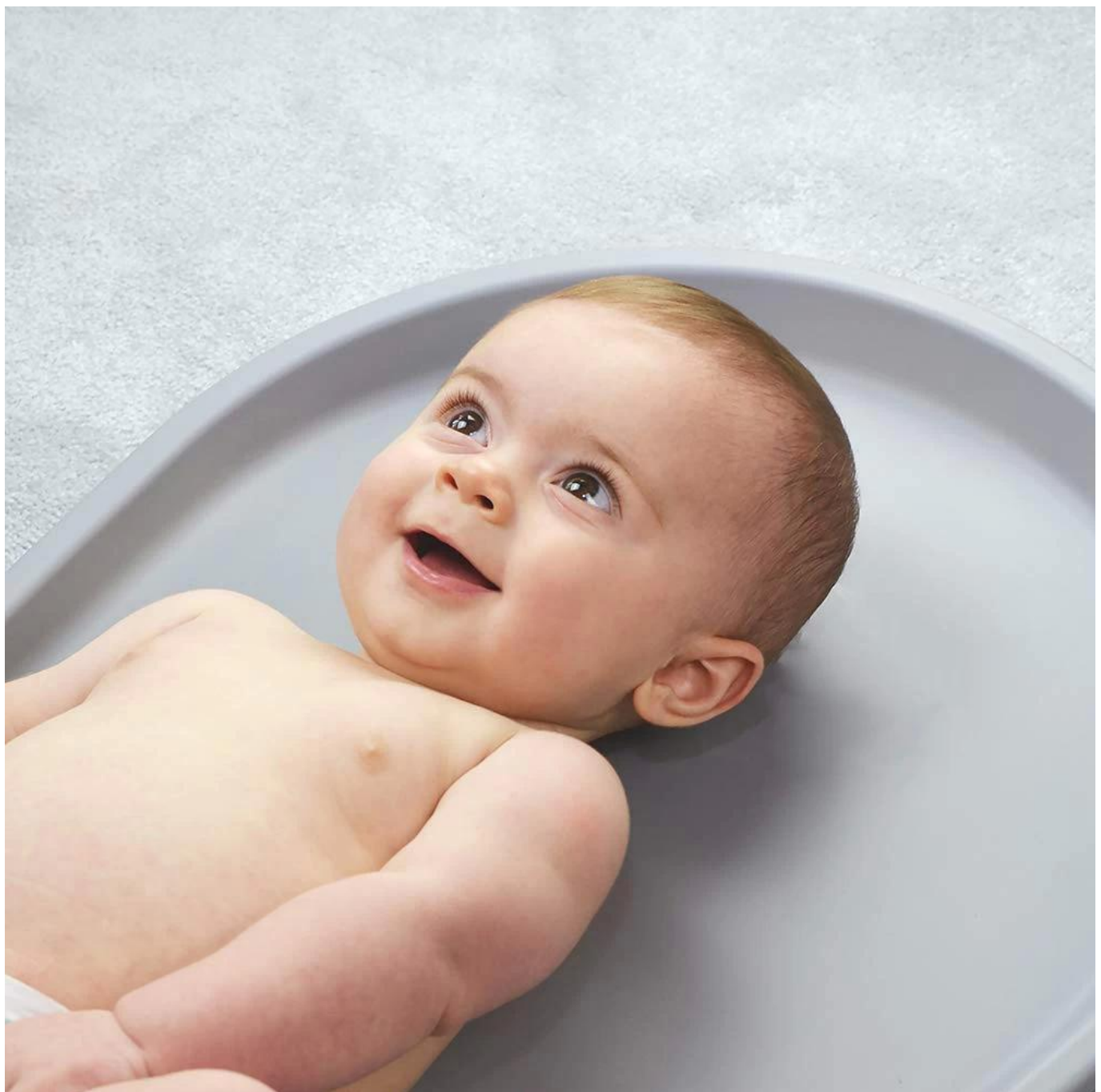
Gran oferta, cambiador de cama de bebé de alta densidad para bebé