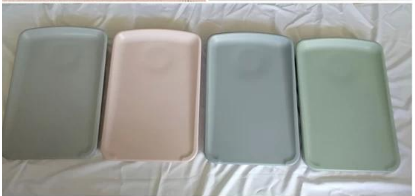
Fábrica personalizar h Almohadilla para cambiar pañales de espuma moldeada para bebés