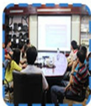
Xiamen University training course