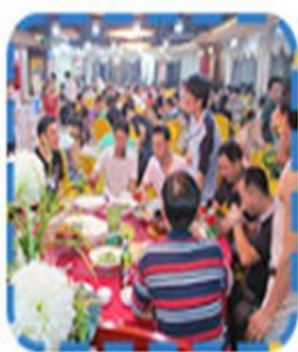
The Mid Autumn Festival