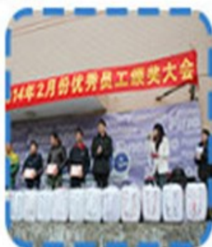
Excellent employee Award Presentation Ceremony