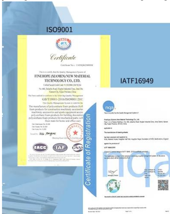
Finehope a obtenu le certificat ISO 9001 en continu depuis 2003.

Autre: OEM chinois et usines de transformation, spécialisées dans la production de produits en PU, y compris les accessoires (fer, bois, plastiques, etc.).