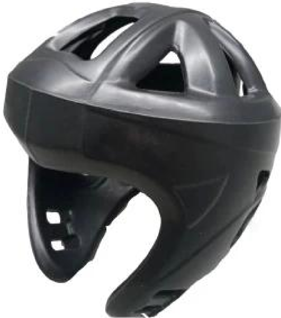
L'art martial de taekondow de mousse d'unité centrale de polyuréthane protège le casque de garde de tête