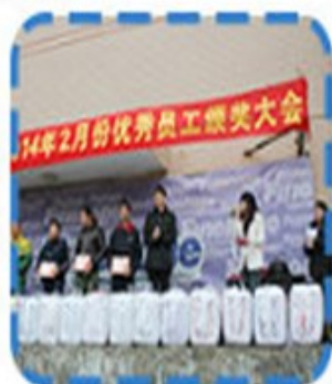
Excellent employee Award Presentation Ceremony