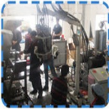
Lean production lines on 4th Floor