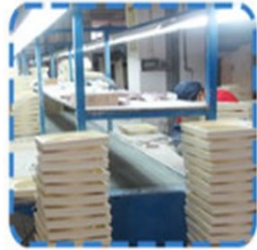
Polishing production lines on the 2nd Floor