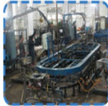
Cap & base sets production lines on the 1st Floor