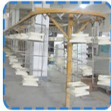
Cap & base products painting production lines on the 2nd floor