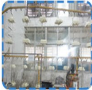
Painting production lines on the 1st Floor