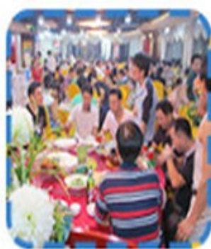
The Mid Autumn Festival