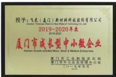
Xiamen Growth-oriented Micro, Small & Medium Enterprises