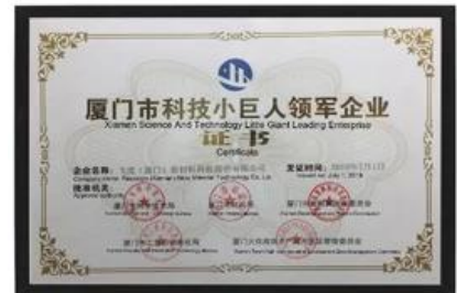
Xiamen Science and Technology Little Giant Leading Enterprise