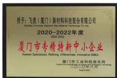
Xiamen Specialized, Refining, Differentiate, Innovative SMEs