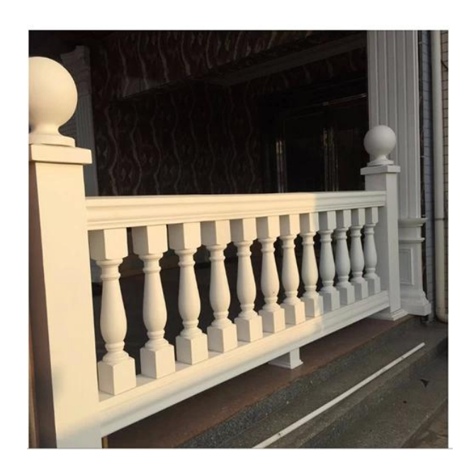
A Breif Introduction About Our Company