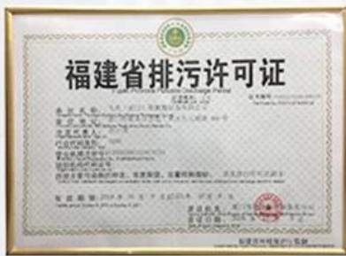
Fujian Province Pollution Discharge Permit

Pollution discharge permits are the "identity cards" of all entities involved in the discharge of pollutants and are issued by the Xiamen Municipal Environmental Protection Bureau. General Secretary Xi Jinping emphasized that "the ecological environment should be protected like the eyes, and the ecological environment should be treated like life." Premier Li Keqiang said: "Environmental pollution is a hazard to the people's livelihood and the pain of the people's hearts. It must be dealt with an iron fist." The Chinese government's determination to improve the environmental quality of the atmosphere, water bodies, and soil cannot be ignored. Pollution permits are an important factor that must be considered in international procurement. Otherwise, the factory has hidden dangers and will be ordered to stop production, which will affect the delivery date. It can be seen that Finehope is a manufacturer with long-term cooperation and stable delivery.