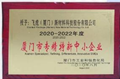
Xiamen Specialized, Refining, Differentiate, Innovative SMEs

Pollution discharge permits are the "identity cards" of all entities involved in the discharge of pollutants and are issued by the Xiamen Municipal Environmental Protection Bureau. General Secretary Xi Jinping emphasized that "the ecological environment should be protected like the eyes, and the ecological environment should be treated like life." Premier Li Keqiang said: "Environmental pollution is a hazard to the people's livelihood and the pain of the people's hearts. It must be dealt with an iron fist." The Chinese government's determination to improve the environmental quality of the atmosphere, water bodies, and soil cannot be ignored. Pollution permits are an important factor that must be considered in international procurement. Otherwise, the factory has hidden dangers and will be ordered to stop production, which will affect the delivery date. It can be seen that Finehope is a manufacturer with long-term cooperation and stable delivery.