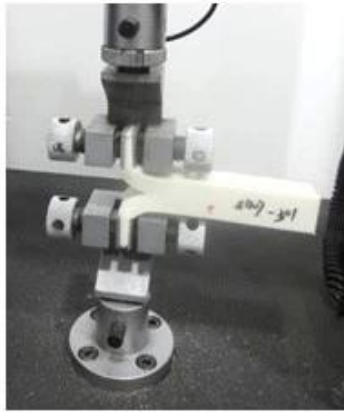
Tear Resistance Test