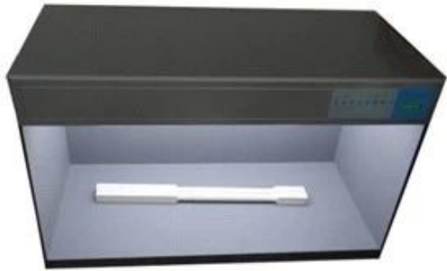
Standard Color compare Lighter box