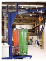
* PU Foaming Equipment PU(聚氨酯) 发泡设备