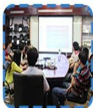
Xiamen University training course