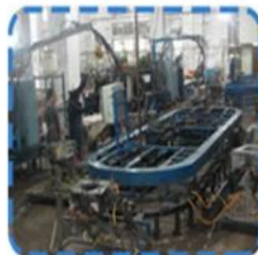
Cap & base sets production lines on the 1st Floor