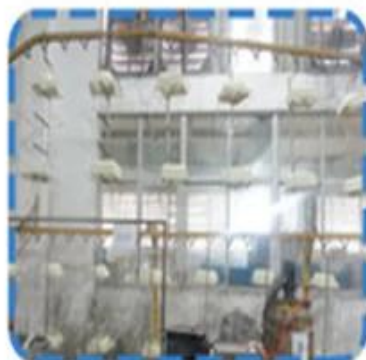
Painting production lines on the 1st Floor