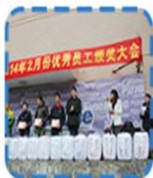
Excellent employee Award Presentation Ceremony