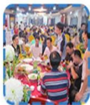
The Mid Autumn Festival