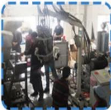
Lean production lines on 4th Floor