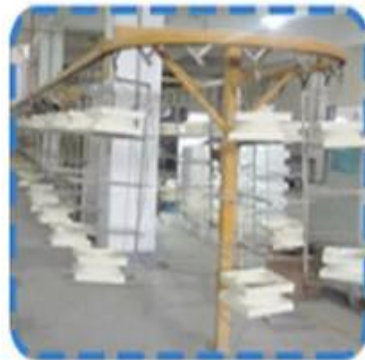
Cap & base products painting production lines on the 2nd floor