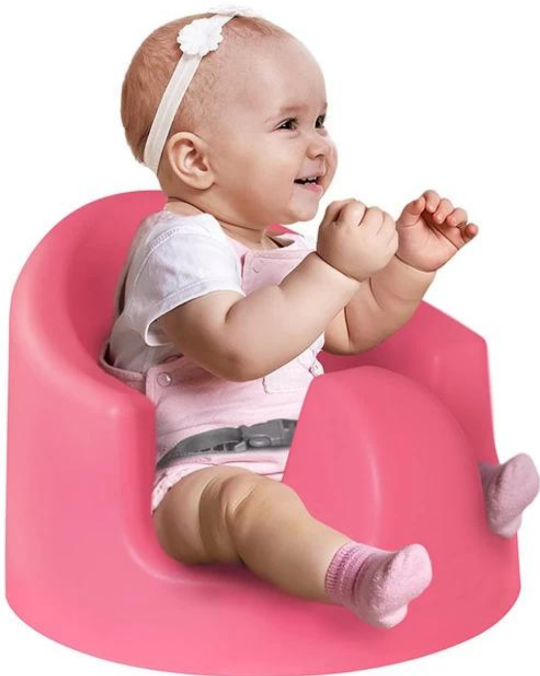
Seggiolino per bambini in schiuma di poliuretano stampato in fabbrica personalizzabile