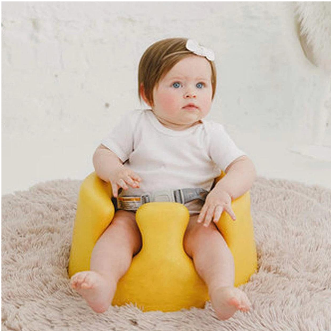
Finehope Personalizza il bambino Comodo Sit Up Infant Trainer Supporto Sedie da pavimento Posti a sedere Hip Chair Carrier Bumbo Seat