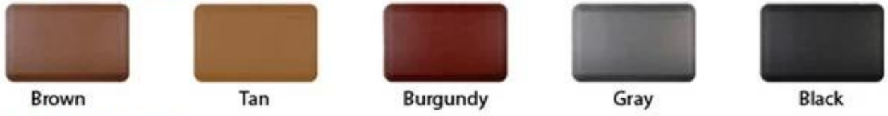
Brown Tan Burgundy Gray Black