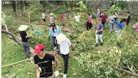
Voluntary tree planting after Super Typhoon Meranti in 2016