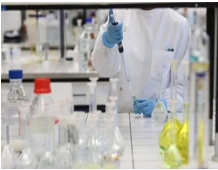
PU 2003 年 Finehope 与 PU 合作