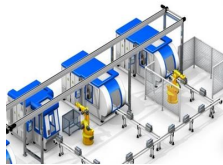
Finehope 2003 年 Finehope 与 PU 合作