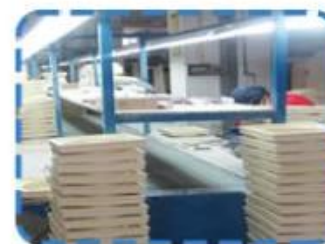
Polishing production lines on the 2nd Floor