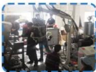
Lean production lines on 4th Floor