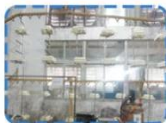
Painting production lines on the 1st Floor