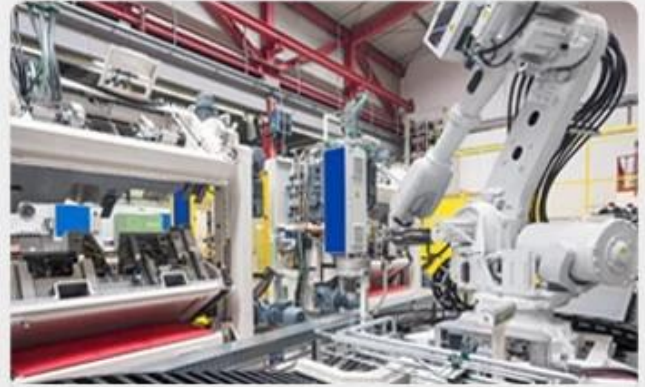
Robot spray mould release agent and injection PU raw material