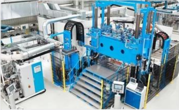
KRAUSS MAFFEI High Pressure Reaction Injection Molding (RIM) Machine from Germany