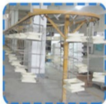
Cap & base products painting production lines on the 2nd floor