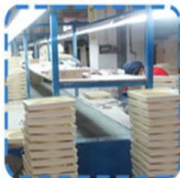
Polishing production lines on the 2nd Floor