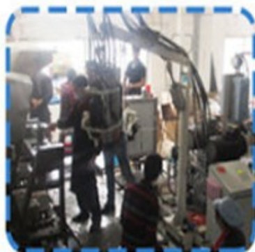
Lean production lines on 4th Floor