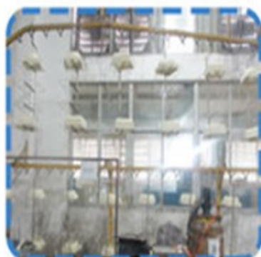
Painting production lines on the 1st Floor