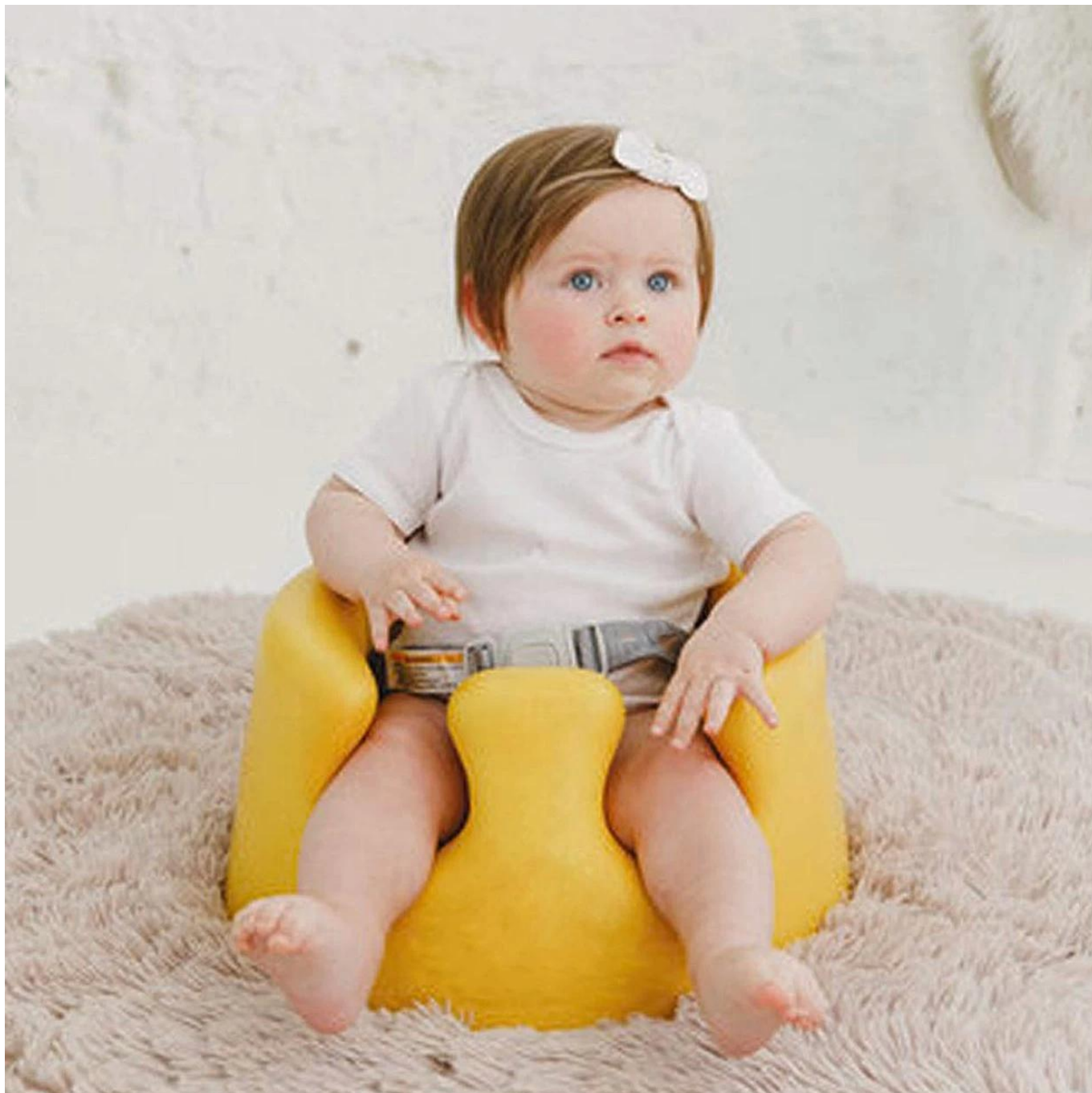
Finehope Aanpassen Baby Comfortabel Sit Up Infant Trainer Ondersteuning Vloer Stoelen Zitting Heup Stoel Carrier Bumbo Seat