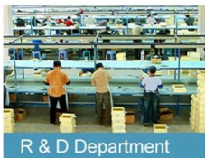
R & D Department