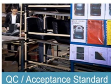
QC / Acceptance Standard