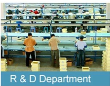
R & D Department