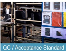
QC / Acceptance Standard