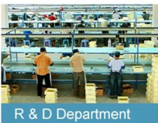
R & D Department