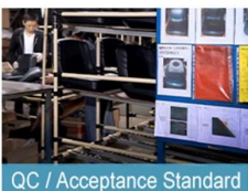
QC / Acceptance Standard