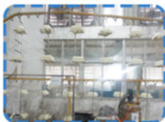
Painting production lines on the 1st Floor