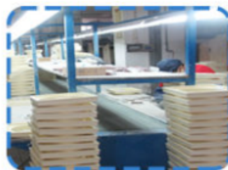
Polishing production lines on the 2nd Floor