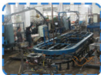
Cap & base sets production lines on the 1st Floor