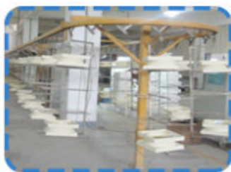
Cap & base products painting production lines on the 2nd floor