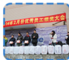
Excellent employee Award Presentation Ceremony