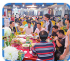
The Mid Autumn Festival