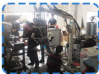
Lean production lines on 4th Floor