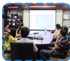
Xiamen University training course